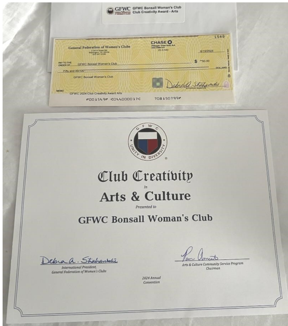
Award and $50 check from the General Federation of Women's Clubs! (Click on "View" then "Page Width" for a larger image.)

As a result of the interest group name change new members have joined, suggested topics abound, camaraderie and friendship among the members has been wonderful carrying on the legacy of fellowship that the group has experienced for many years.