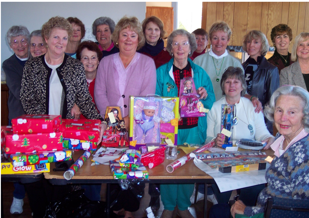
A delightful memory of BWC members wrapping gifts for needy families.